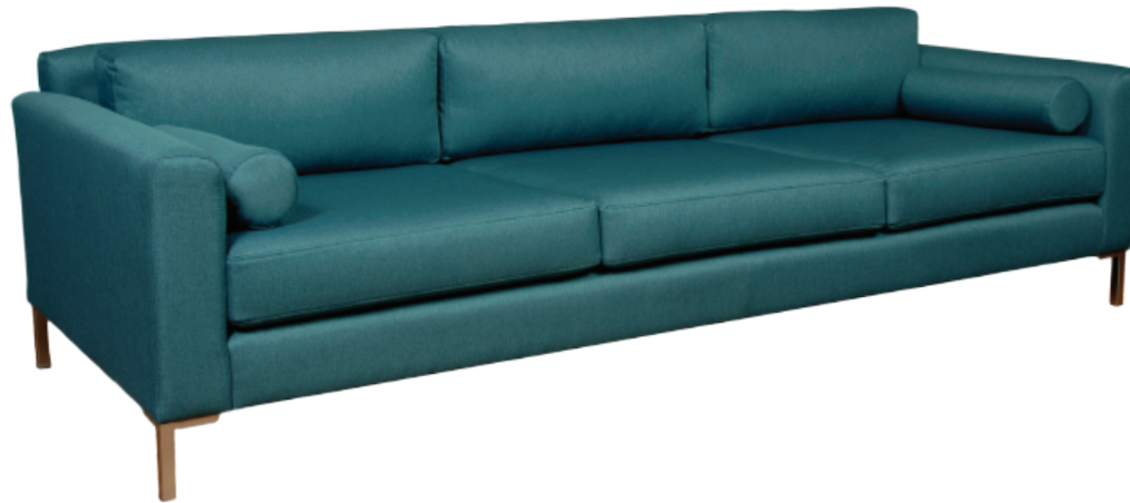
Body Fabric: Winfield Ocean Bolster Pillow Fabric: Winfield Ocean