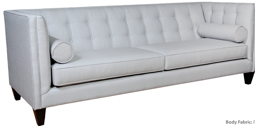
Body Fabric: Polo Grey Bolster Pillow Fabric: Polo Grey