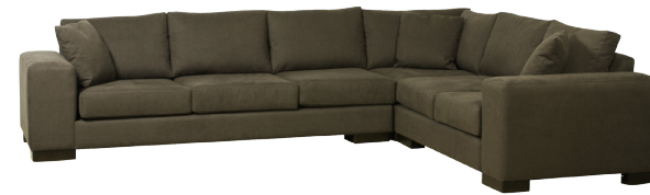
LAF One Arm Sofa, Corner & RAF One Arm Love Seat